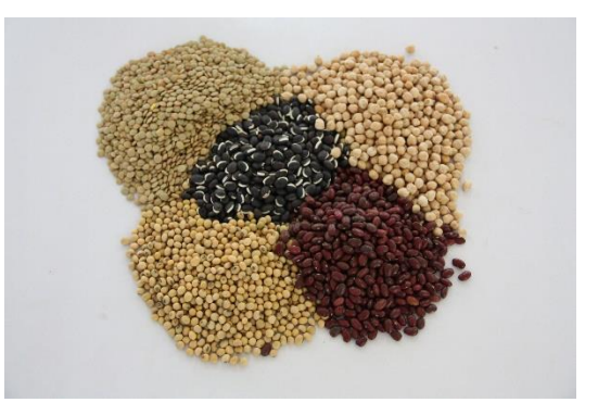
Legumes and Pulses 1