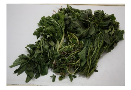
Dark Green Leafy Vegetables