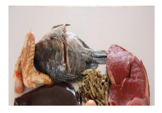
Meat Poultry and Fish